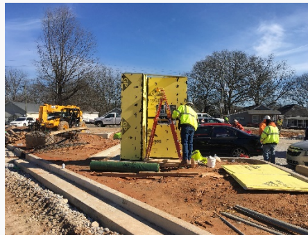
Installation of mock up wall