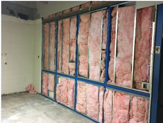
Renovation in wall