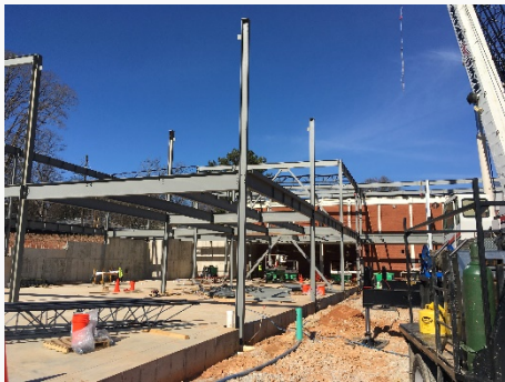
Installation of structural steel