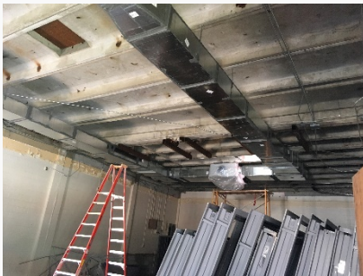
Auditorium MEP OH Rough