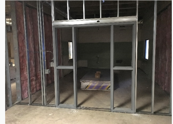
Installation HM frames