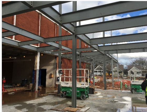
Structural Steel Seq 2