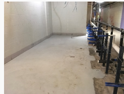
2" topping at rest rooms