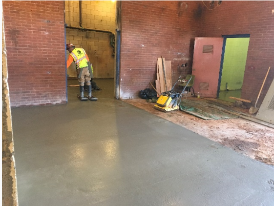
SOG pour back at electrical room